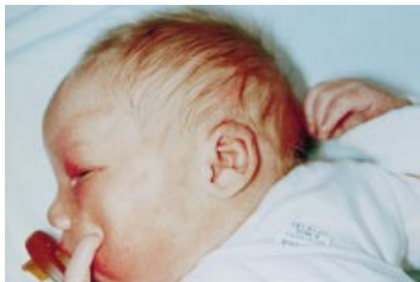
Figure 3 Photograph of baby with oculocutaneous albinism 3. Note brown colour of hair, a characteristic of this type of albinism. OCA 3 has only been reported in black patients.

In OCA 1, the gene mutation affects tyrosinase and, in OCA 2, the mutation affects the gene for P protein. OCA 3 is caused by a defect in tyrosine related protein 1 (TRP-1). 21 TRP-1 is the product of the brown locus in the mouse. A mutant allele in the mouse at that position causes the fur to be brown rather than black. 22 The human gene coding for TRP-1 is on the short arm of chromosome 9 (9p23). 23 The phenotypic features of OCA 3 in black patients are light brown hair, light brown skin, blue/brown irides, nystagmus, and diminished visual acuity (Fig 3). OCA 3 has not been detected in white or Asian races, perhaps because the phenotype may not be obvious. It is autosomal recessive. Although the function of TRP-1 in human melanogenesis is not fully determined, it acts as a regulatory protein in the production of black melanin. Its